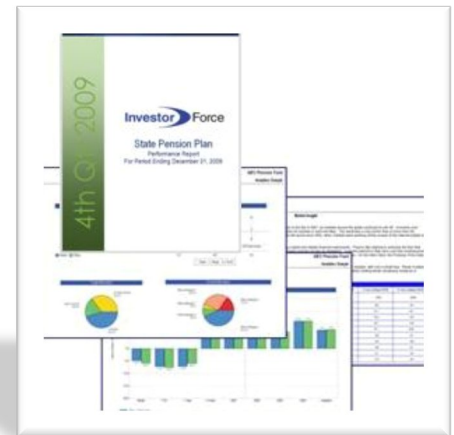
Produce High Quality, Content-Rich Performance Reports